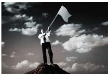
Not an actual photograph of IRS official formally announcing policy change

return filing. Organizations claiming the refund will have to maintain documentary support of their refund request. In contrast, the IRS is going to establish a "standard" amount for individuals which can be used as a default but can be itemized should an individual's taxes have been greater than the standard amount. The refund amount will be limited to the period from February 28, 2003, until August 1, 2006.